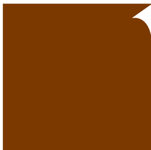
RED OXIDE R63