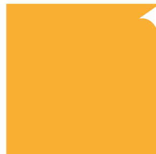
GOLDEN YELLOW Y14