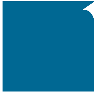
HARBOUR BLUE B24