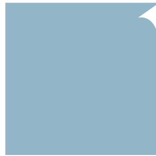
BLUE GREY N53