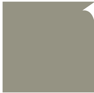
KOALA GREY N45